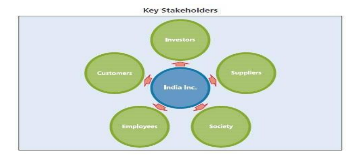
FIG 2.1: Key Stakeholders

CSR is a company's commitment to its stakeholders to conduct business in a socially, environmentally and economically sustainable way that is ethical and transparent. Present day business scenario has changed visibly from the traditional way of focusing on profit to today fulfilling the social responsibility and contributing to the various stakeholders such as employees, investors, customers and community at large who are impacted by their actions. Immense competition and increasing globalization has pushed the companies to fine-tune their strategies and business models to sustain over the long term and CSR is expected to play an important role in the coming years.